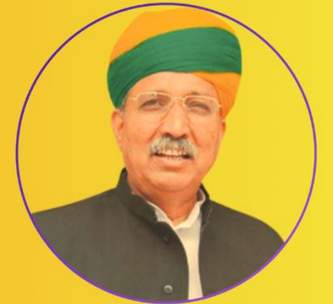
Shri Arjun Ram Meghwal Hon'ble Minister of State, Ministry of Law & Justice (Independent Charge)