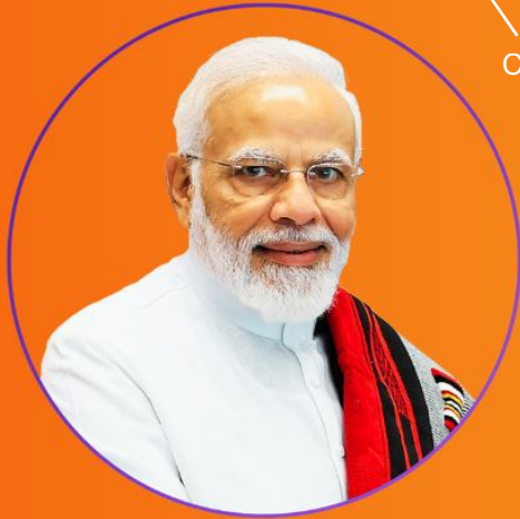
Shri Narendra Modi Hon'ble Prime Minister